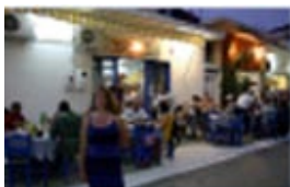
UNSUITABLE PHOTO too dark, too blurred, person too small